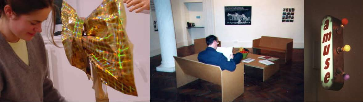
"Welcome to Liverpool" Bluecoat Gallery