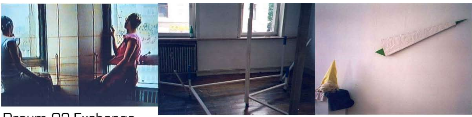
Raum 02 Exchange