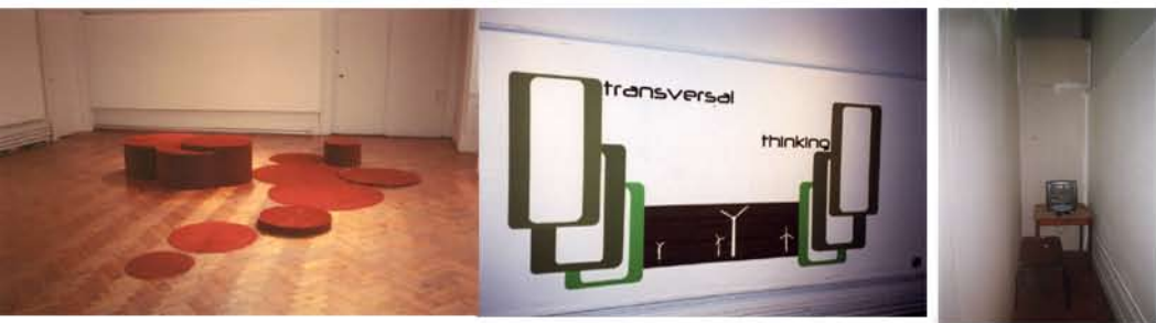
"Alternative Strategies" Crawford Municipal Gallery Cork

Protoacademy has worked in a number of different spaces outside of Edinburgh. Some of the projects we did in 2001-02. These project are also described more in depth on our website www.protoacademy.org