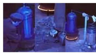
Rraum 02 Exchange / Gasthof